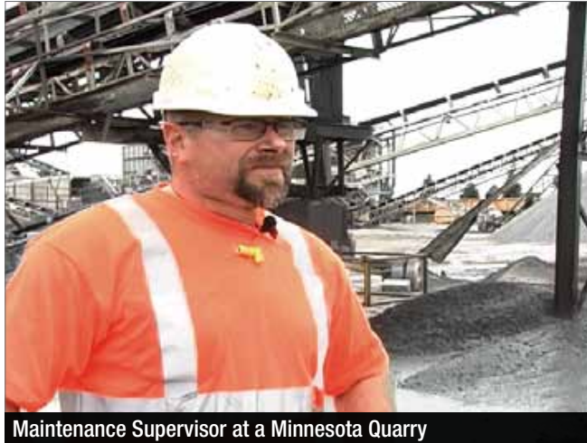
Maintenance Supervisor at a Minnesota Quarry