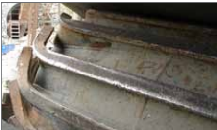
Fig 16.1 No More Bent Wings