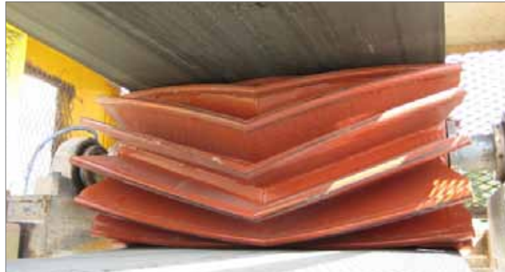
Chevron Wing Pulley