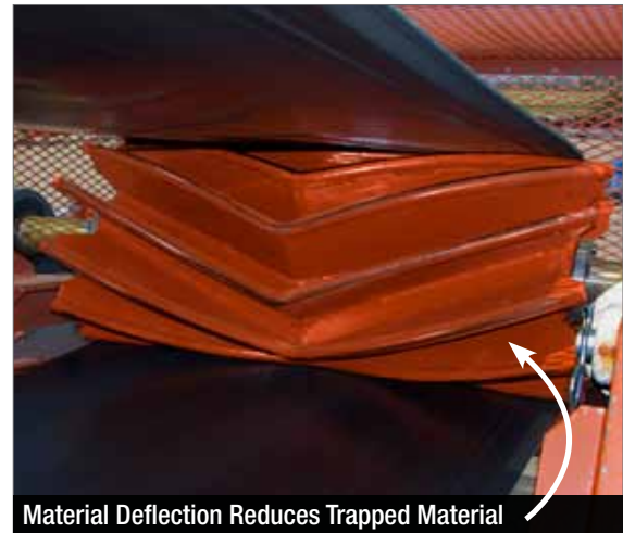
Material Deflection Reduces Trapped Material